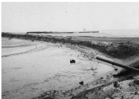
Fig. 2. Pipe of produced water discharge to the pit.

A contaminated soil around a disposal pit of produced water at a selected oilfield has been chosen as a case study area (Fig. 2).